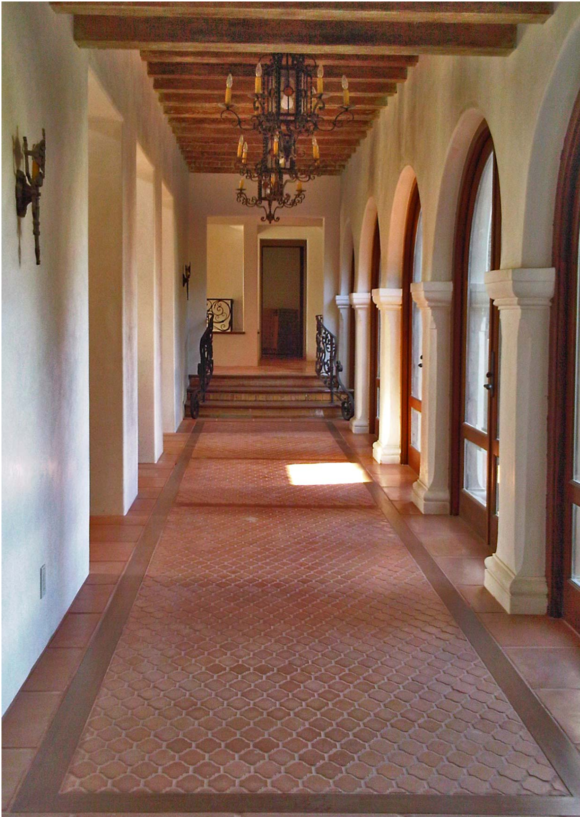
QuariCrete 3x4 San Felipe, Terracotta, Entry Hallway, Beverly Hills, CA